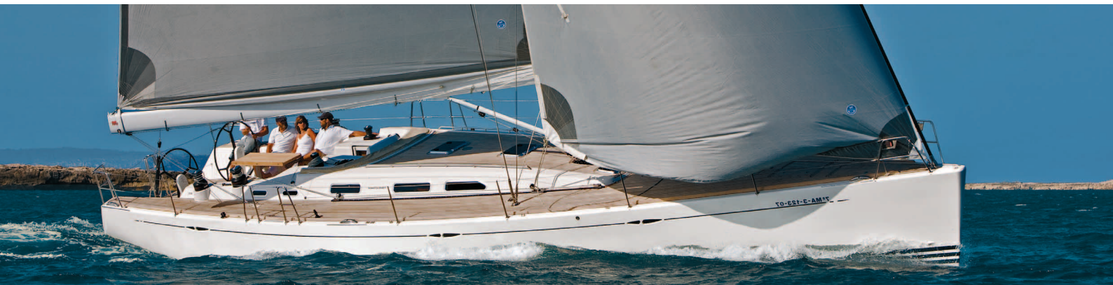
Xperformance 34 37 40 43 46 50 55 65 Stil, Komfort und kompromissloses Segelvergnügen mit Gefallen für Sportlichkeit.