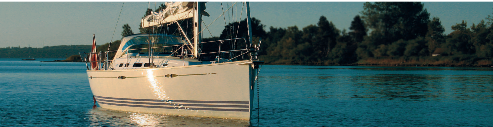
Xcruising 42 45 Komfortables Fahrtsegeln ausgestattet mit hervorragenden Segeligenschaften.