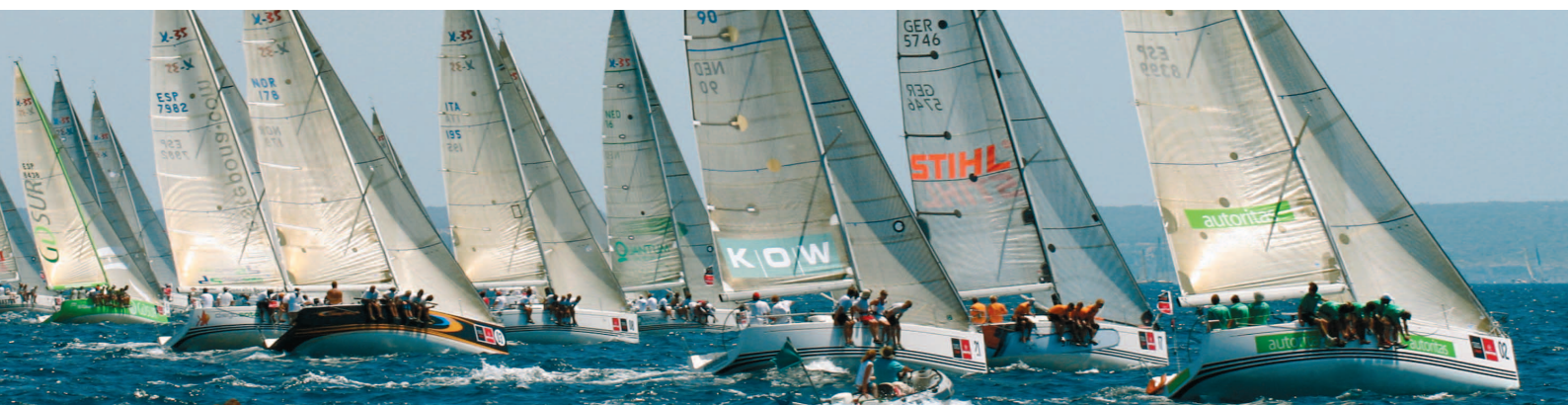
Xracing 35 41 Einheitsklassen mit internationalem anerkannten Status. Der faire Weg des Regattasegels. x-yachts.com